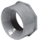
Part No. AW 107C Flush Bushing (SxH)