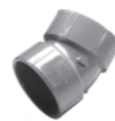
Part No. AW 324C 1/16 Bend (HxH)