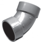
Part No. AW 321C 1/8 Bend (HxH)