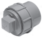
Part No. AW 105XC Fitting Cleanout Adapter w/C.O. Plug (Spigot)