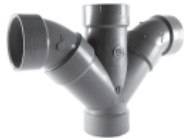
Part No. AW 507C Double Combination Wye and 1/8 Bend (All Hub)