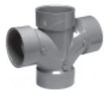
Part No. AW 428C Double Sanitary Tee (All Hub)