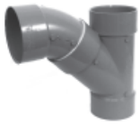
Part No. AW 503C Combination Wye and 1/8 Bend (Two Pieces) (All Hub)