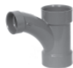
Part No. AW 502C Combination Wye and 1/8 Bend, Reducing (One Piece) (All Hub)