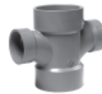
Part No. AW 429C Double Sanitary Tee, Reducing (All Hub)