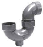
Part No. AW 707XC P-Trap w/Solvent Weld Joint & Clean Out (H x H)