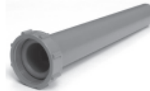
Part No. AW 1512PC CPVC Tail Piece w/Nut (May be cut to length)