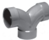
Part No. AW 327C Double 1/4 Bend (HxHxH)