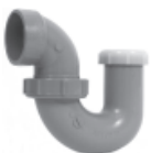
Part No. AW 711PC P-Trap w/Union and 1 1/2 x 1 1/4 Nut (SLIP x H w/Plastic Nut)