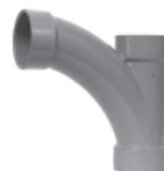
Part No. AW 501C Combination Wye and 1/8 Bend (One Piece) (All Hub)