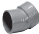
Part No. AW 326C 1/16 Bend, Street (SxH)