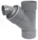
Part No. AW 504C Combination Wye and 1/8 Bend, Reducing (Two Pieces) (All Hub)