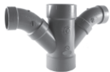
Part No. AW 507C Double Combination Wye and 1/8 Bend, Reducing (All Hub)