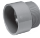
Part No. AW 109C Male Adapter (H x MPT)