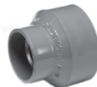
Part No. AW 102C Pipe Increaser-Reducer (H x H)