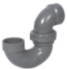
Part No. AW 708PC P-Trap w/Union and Plastic Nut (H x H)