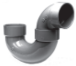
Part No. AW 706XC P-Trap w/Solvent Weld Joint (H x H)