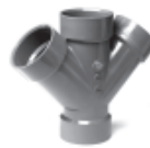
Part No. AW 611C Double Wye (All Hub)